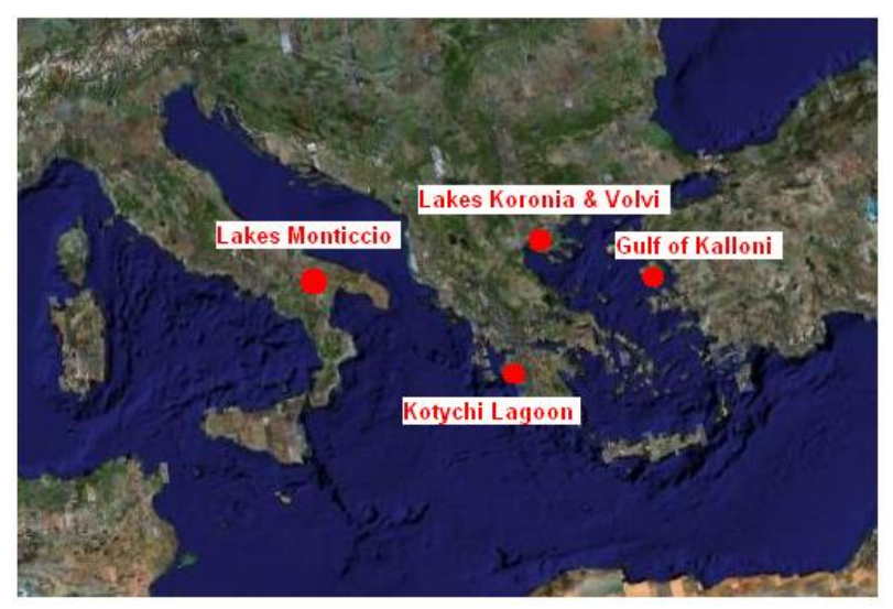
Figure 1. Test sites of the WETMUST project

The WETMUST project is aiming to develop and evaluate an innovative multiresolution monitoring system for wetlands of international importance. The selected test sites (Figure 1) are the following: (i) Lakes Koronia and Volvi (Greece), (ii) Gulf of Kalloni (Greece), (iii) Kotychi Lagoon (Greece), and (iv) Lakes Monticcio (Italy). The objective of this work is to describe the design, the technical and functional specifications of the monitoring network under development in the WETMUST project.